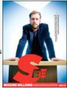
Volume 1 No. 742 February 14, 2008